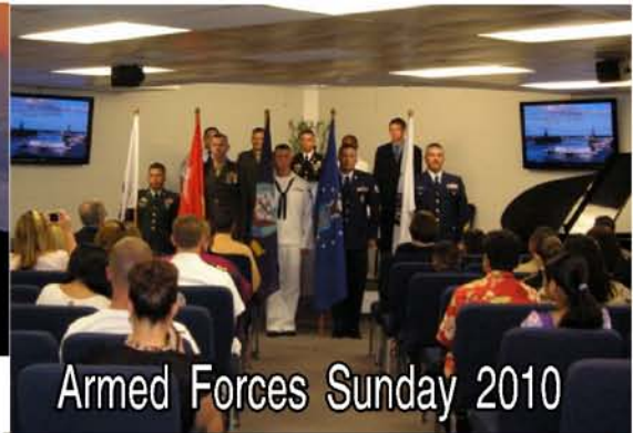
Armed Forces Sunday 2010